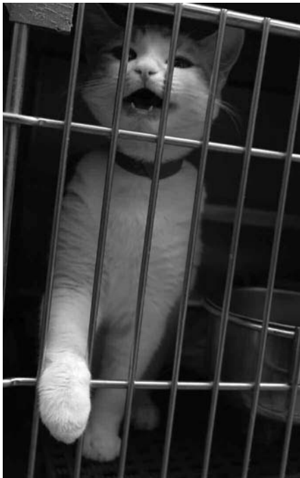
Just two of the reasons we want a better shelter for homeless animals in Great Falls.