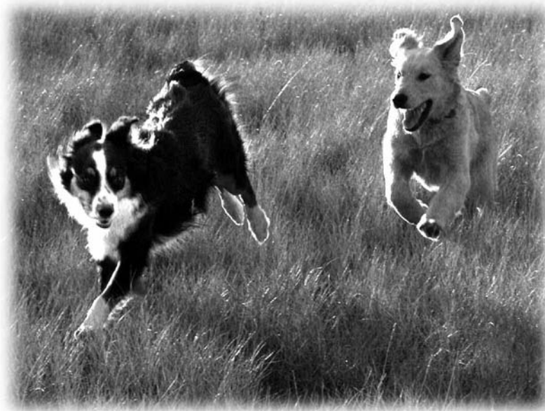
That new dog park should keep Moab & Guido busy for hours! Then we can get a REAL cat nap.

Dogs of all kinds will enjoy the future dog park.